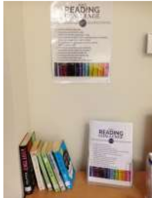
Above—2016 Reading Challenge , small display of fiction books at The Northumbria Hospital