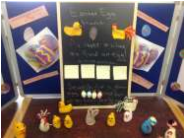
Easter Egg Hunt—NTGH

There are Easter eggs hidden in our libraries at North Tyneside, Hexham and Wansbeck hospitals. Come and follow the clues and win some Easter eggs. If you can't get into the library, hunt for the eggs on the library website instead