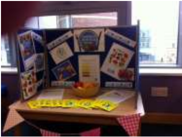
Nutrition & Hydration Week display—Hexham