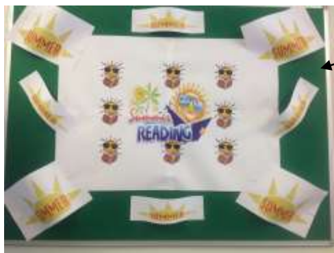
'Summer Reading' display at NTGH