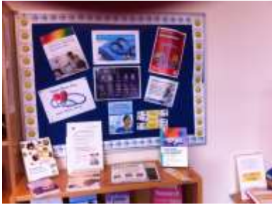
Nursing week display—Hexham