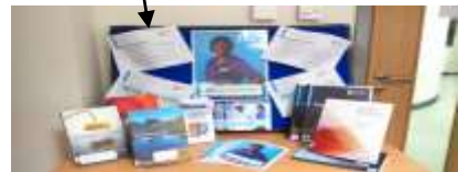
NSECH revalidation display