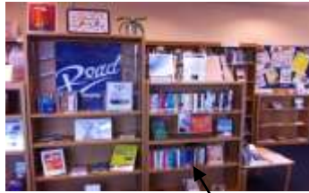
Literacy display Hexham