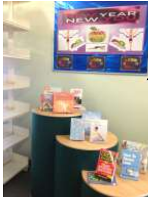
New Year, New You display at NTGH