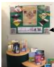
Ethics display at NTGH and Wansbeck