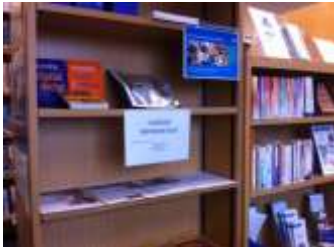
Careers display at Hexham

Above; Christmas guess the TV doctors and nurses quiz from the photographs at NTGH. Something fun for the festive season and chocolately prizes up for grabs!