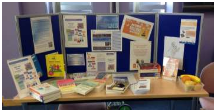
Library display for HWB road show at Hexham Hospital, 22.9.15