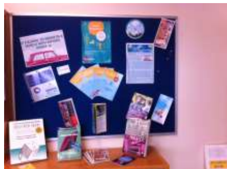
Stoptober display— Hexham