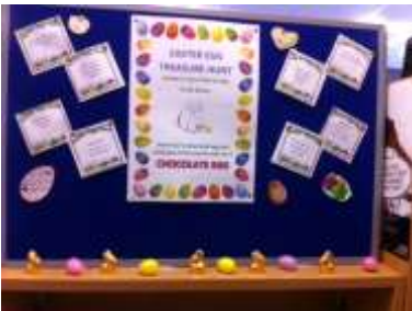
Easter Egg Hunt—Hexham