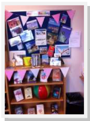
Hexham "Summer" display