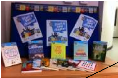
Quick Reads displays at NSECH and Hexham

The library has a dedicated revalidation webpage which can be found here The webpage is packed with useful information including online resources, journals, books, knowledge guides and information about reflection. Staff newsletter 11.3.16