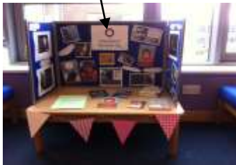
International Women's Day display—Hexham