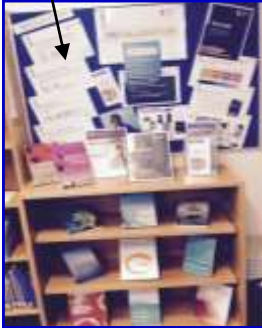
Hexham Revalidation display