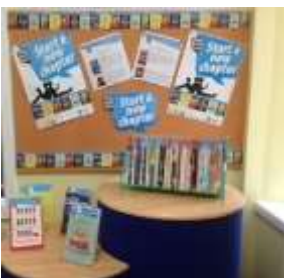
Quick Reads at Wansbeck