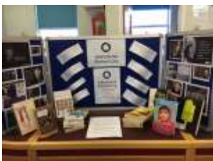
Left—International Women's Day NTGH